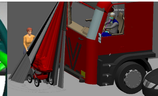
Fig. 3: Testing the external visual field