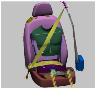
Fig. 1: eBTD certification