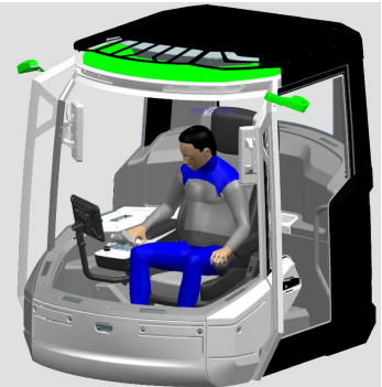
Fig. 3: Task analysis